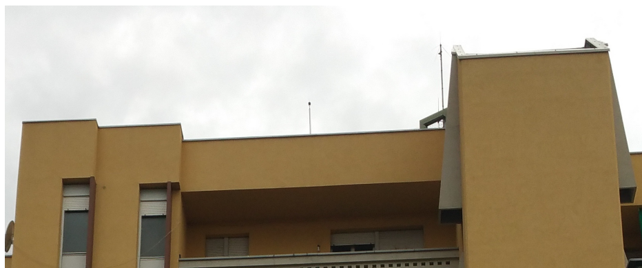
Figure 4.2. e 4.3. Strumentazione Arpae presso il condominio di via Manin 31.